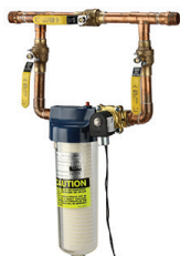
Master Water Control Valve