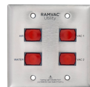
Remote Panels, choice of configuration